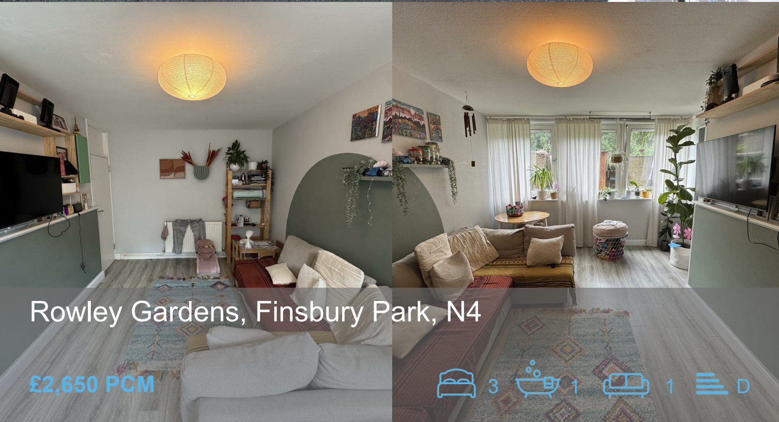
Rowley Gardens, Finsbury Park, N4